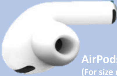
AirPods (For size reference only)