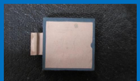
Same footprint as the Microsemi PLAD Parts

For more information on the optical transceivers or any other Product on this Newsletter, please contact Protec GmbH